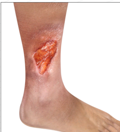
Ulcus cruris on the lower leg

Due to its individual and tool-free adaptability, especially to challenging wound locations, LIQUEEL® is a true multitalent.