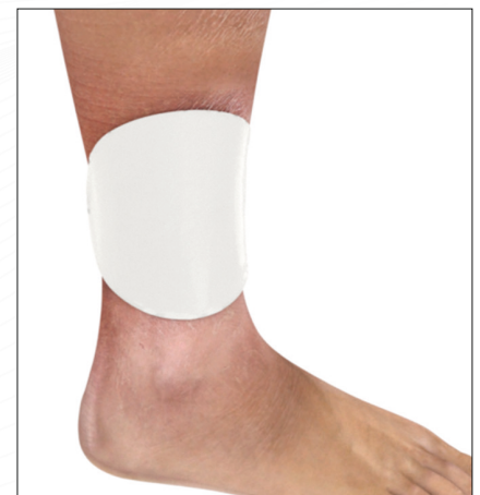
Ulcer - covered with LIQUEEL® PT

The exemplary illustrations show that LIQUEEL® PT can be applied very flexibly to flat, concave and convex body sites.